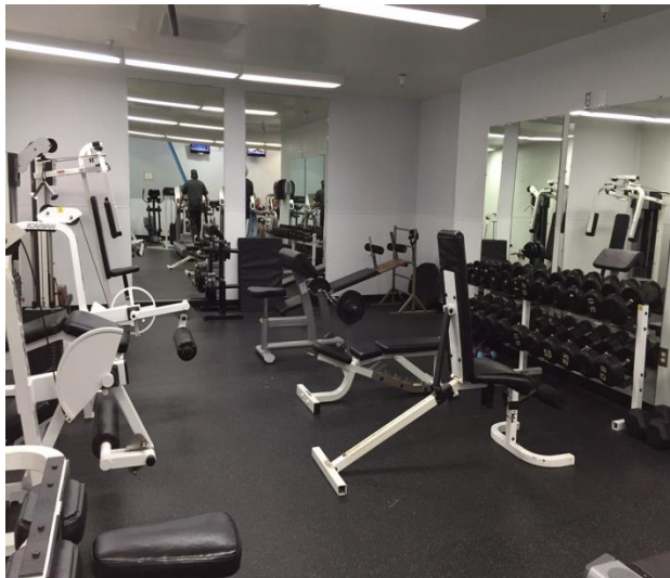
East view of Men's Fitness area

For more information please call the Recreation Director at (480) 384-4066 or the Recreation Assistant at (480) 384-4065.