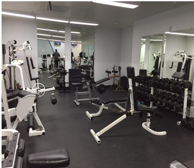
East view of Men's Fitness area

For more information please call the Recreation Director at (480) 384-4066 or the Recreation Assistant at (480) 384-4065.